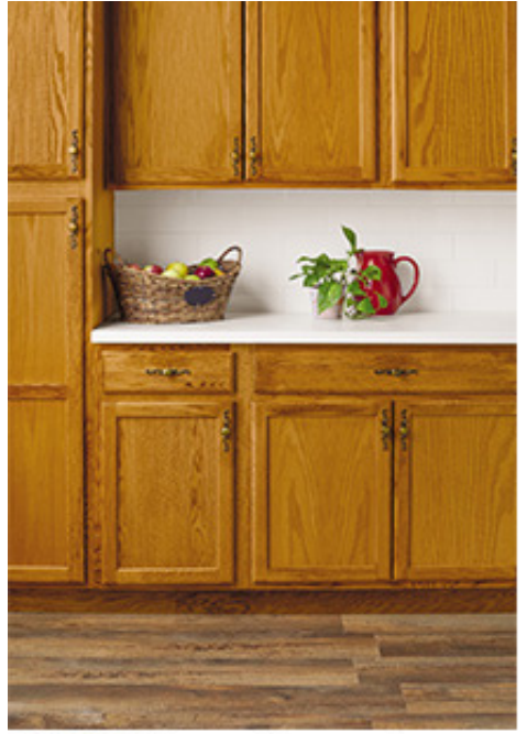
BEFORE Years of use and wear quickly age cabinet doors, and the current stain or paint color may be out of style.