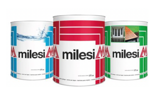
Milesi 2K Waterbased Lacquer Paint (HKA-11x / HKR-11x)

We set up a sprayer in central location, double check tape and plastic is still In tact, scuff sand cabinets, vacuum area, wipe with tack cloth, and then Oil Prime cabinets.