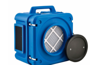
Negative Air Machine W/ HEPA Filter, 210W,